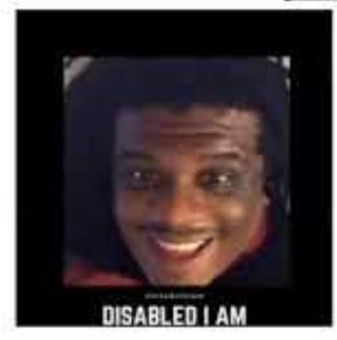
Image Description: Black picture frame that says "Disabled I AM"; in the frame there is a smiling black man with medium complexion, moustache, and locs.